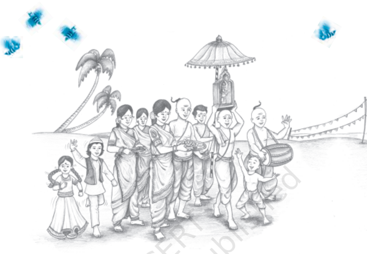
Our family used to arrange boats for carrying idols of the Lord from the temple to the marriage site.

father; Aravindan went into the business of arranging transport for visiting pilgrims; and Sivaprakasan became a catering contractor for the Southern Railways.