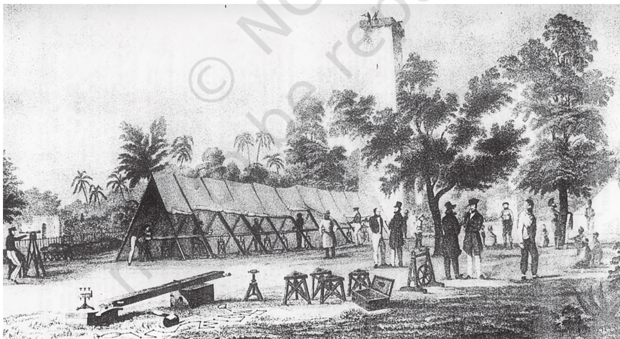
Fig. 6 – Mapping and survey operations in progress in Bengal, a drawing by James Prinsep, 1832 Note how all the instruments that were used in surveys are placed in the foreground to emphasise the scientific nature of the project.

From this vast corpus of records we can get to know a lot, but we must remember that these are official records. They tell us what the officials thought, what