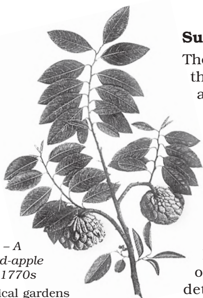
Fig. 5 – A custard-apple plant, 1770s

Botanical gardens and natural history museums established by the British collected plant specimens and information about their uses. Local artists were asked to draw pictures of these specimens. Historians are now looking at the way such information was gathered and what this information reveals about the nature of colonialism.