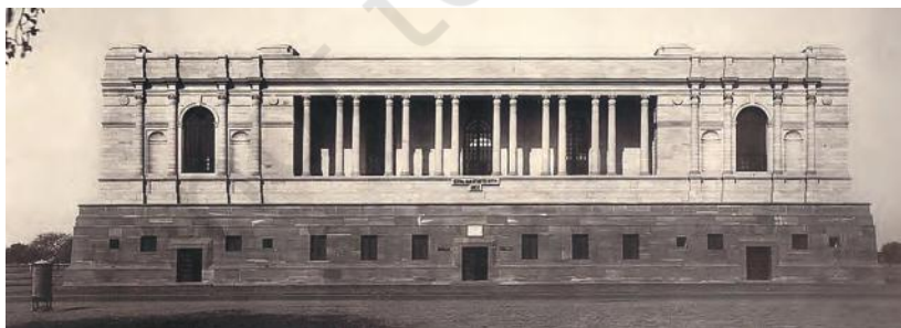
Fig. 4 – The National Archives of India came up in the 1920s

In the early years of the nineteenth century these documents were carefully copied out and beautifully written by calligraphists – that is, by those who specialised in the art of beautiful writing. By the middle of the nineteenth century, with the spread of printing, multiple copies of these records were printed as proceedings of each government department.