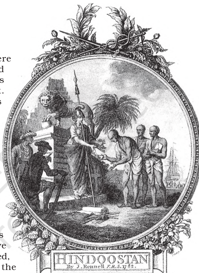
Fig. 1 – Brahmins offering the Shastras to Britannia, frontispiece to the first map produced by James Rennel, 1782

Look carefully at Fig.1 and write a paragraph explaining how this image projects an imperial perception.