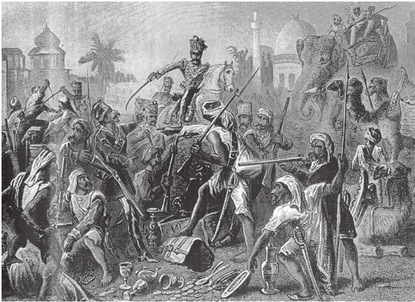
Fig. 7 – The rebels of 1857

Images need to be carefully studied for they project the viewpoint of those who create them. This image can be found in several illustrated books produced by the British after the 1857 rebellion. The caption at the bottom says: “Mutinous sepoy share the loot”. In British representations the rebels appear as greedy, vicious and brutal. You will read about the rebellion in Chapter 5.