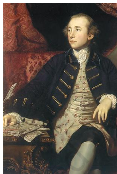
Fig. 3 – Warren Hastings became the first Governor-General of India in 1773

Mill thought that all Asian societies were at a lower level of civilisation than Europe. According to his telling of history, before the British came to India, Hindu and Muslim despots ruled the country. Religious intolerance, caste taboos and superstitious practices dominated