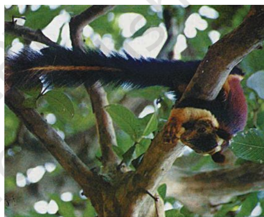
Fig. 7.3 (b) : Giant squirrel

endemic flora of the Pachmarhi Biosphere Reserve. Bison, Indian giant squirrel [Fig. 7.3 (b)] and flying squirrel are endemic fauna of this area. Professor Ahmad explains that the destruction of their habitat, increasing population and introduction of new species may affect the natural habitat of endemic species and endanger their existence.