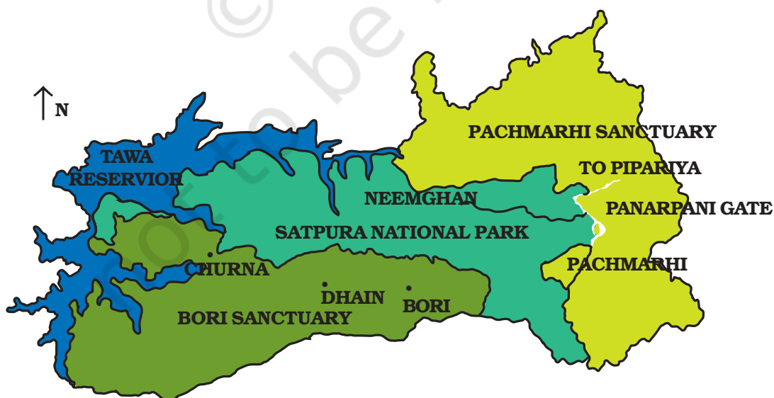
Fig. 7.1 : Pachmarhi Biosphere Reserve