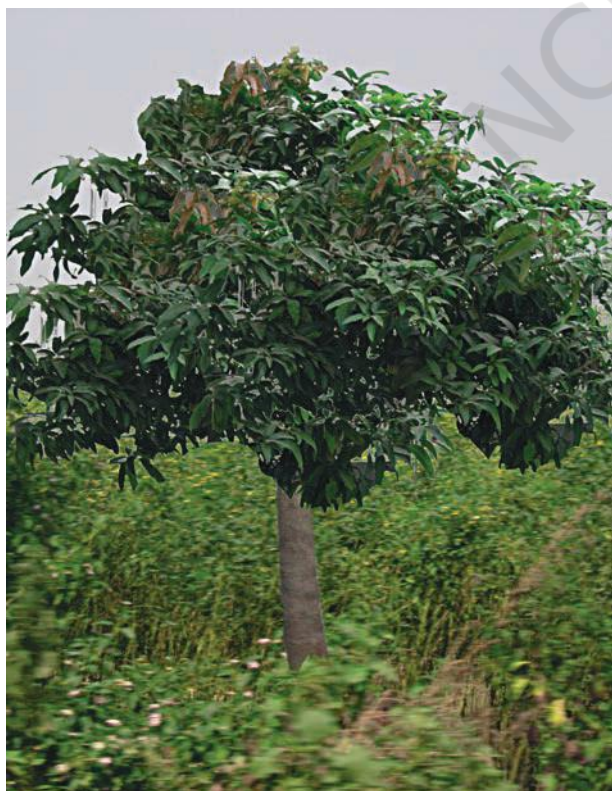
Fig. 7.3 (a) : Wild Mango

Madhavji shows sal and wild mango (Fig. 7.3 (a)) as two examples of the