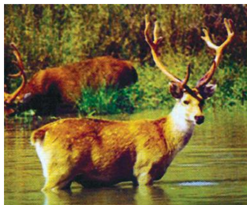
Fig. 7.6 : Barasingha

animals has become difficult because of disturbances in their natural habitat. Professor Ahmad tells them that in order to protect plants and animals strict rules are imposed in all National Parks. Human activities such as grazing, poaching, hunting, capturing of animals or collection of firewood, medicinal plants, etc. are not allowed