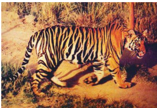
Fig. 7.4 : Tiger

Tiger (Fig. 7.4) is one of the many species which are slowly disappearing from our forests. But, the Satpura Tiger Reserve is unique in the sense that a significant increase in the population of tigers has been seen here. Once upon a time, animals like lions, elephants, wild