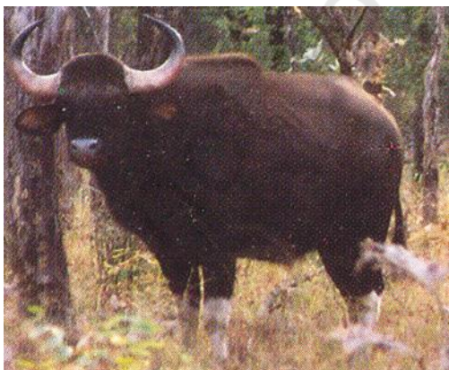
Fig. 7.5 : Wild buffalo

buffaloes (Fig. 7.5) and barasingha (Fig. 7.6) were also found in the Satpura National Park. Animals whose numbers are diminishing to a level that they might face extinction are known as the endangered animals . Boojho is reminded of the dinosaurs which became extinct a long time ago. Survival of some