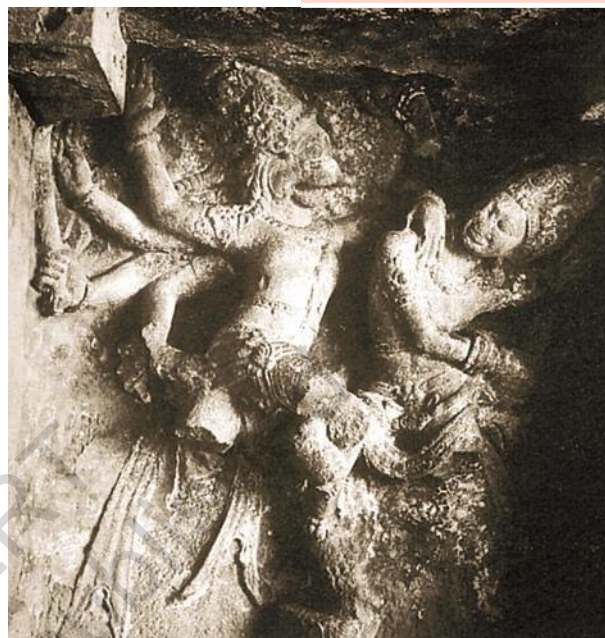
Fig. 1 Wall relief from Cave 15, Ellora, showing Vishnu as Narasimha, the man-lion. It is a work of the Rashtrakuta period.

Many of these new kings adopted high-sounding titles such as maharaja-adhiraja (great king, overlord of kings), tribhuvana-chakravartin (lord of the three worlds) and so on. However, in spite of such claims,