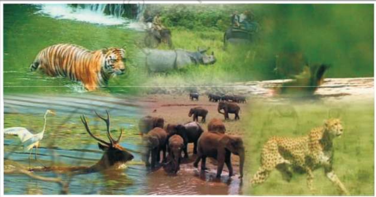
Figure 8.3 : Wildlife

In order to protect them many national parks, sanctuaries and biosphere reserves have been set up. The Government