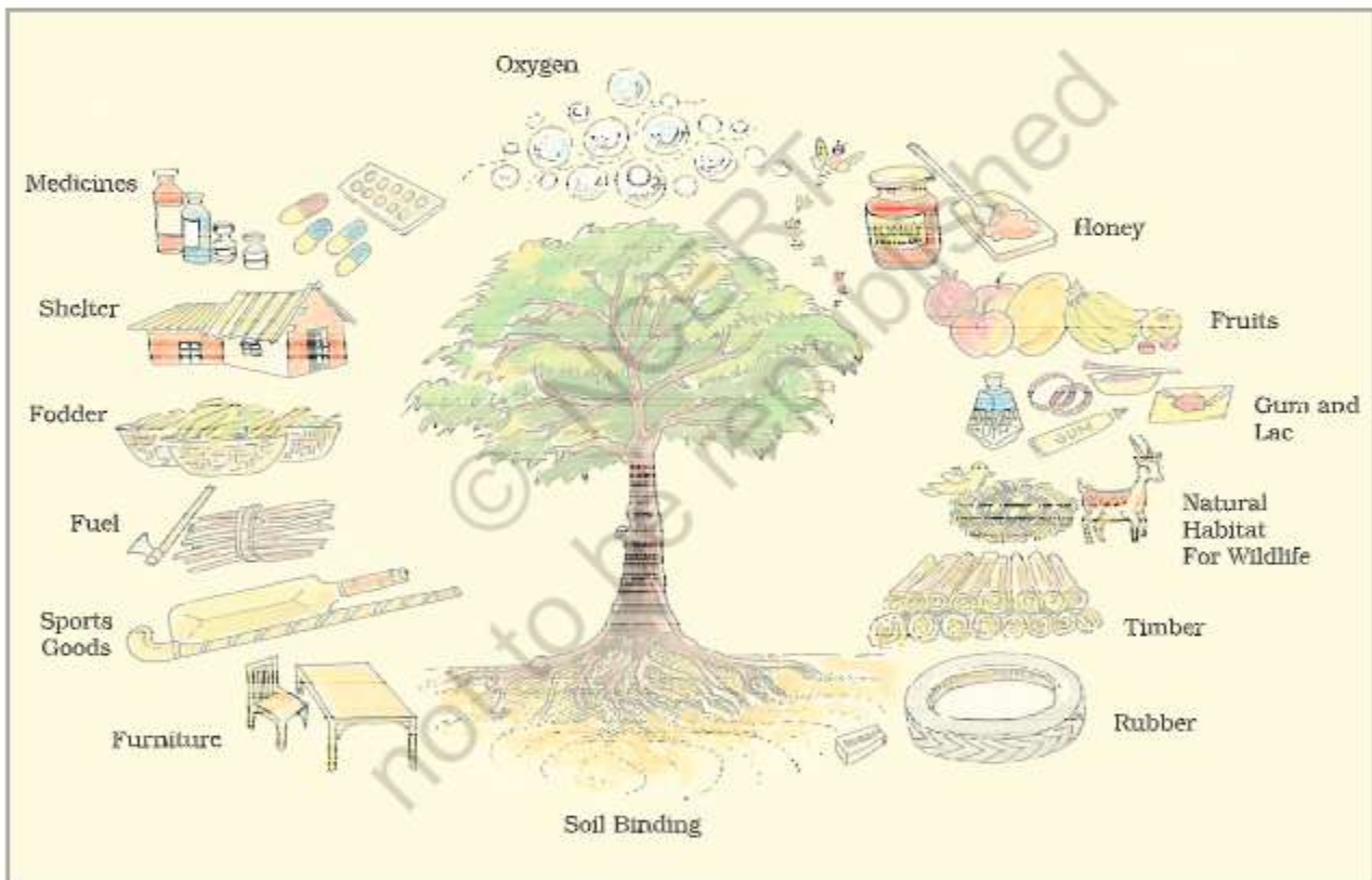
Figure 8.2 : What we get from forests

Leela's parents planted a sapling of "neem" to celebrate her birth. On each birthday, a different sapling was planted. It was watered regularly and protected from severe heat, cold and animals. Children took care not to harm it. When Leela was 20, twenty-one beautiful trees, stood in and around her house. Birds built their nests on them, flowers bloomed, butterflies fluttered around them, children enjoyed their fruits, swung on their branches and played in their shade.