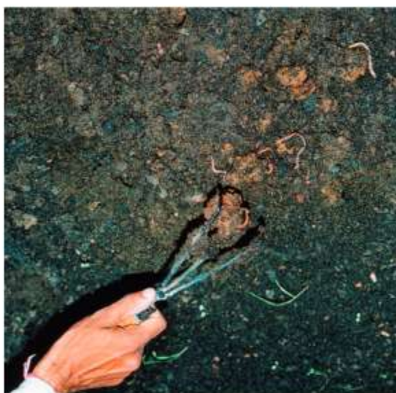
Fig. 16.6 Vermicomposting

Put some wastes as food in one corner of the pit. Most of the worms will shift