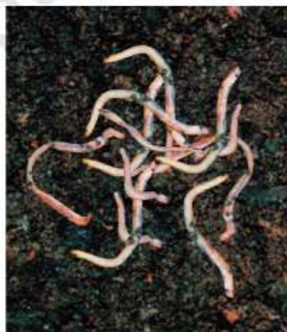
Fig. 16.4 Redworms

Now, your pit is ready to welcome the redworms. Buy some redworms and put them in your pit (Fig. 16.4). Cover them loosely with a gunny bag or an old sheet of cloth or a layer of grass.