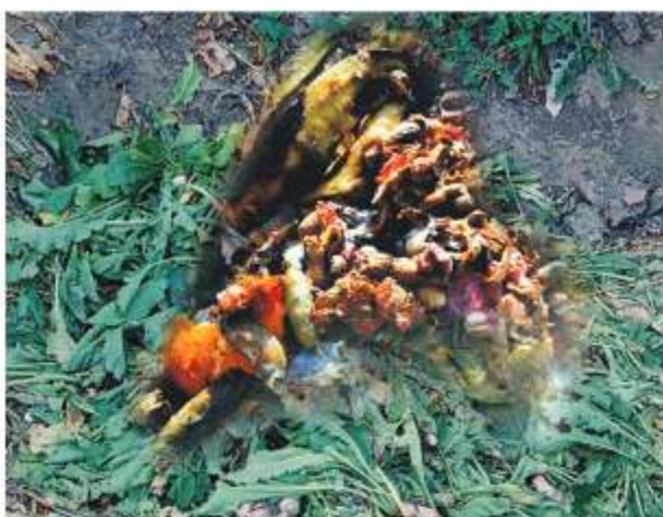
Fig. 16.5 Food for redworms

that may contain salt, pickles, oil, vinegar, meat and milk preparations as food for your redworms. If you put these things in the pit, disease-causing small organisms start growing in the pit. Once in a few days, gently mix and move the top layers of your pit.