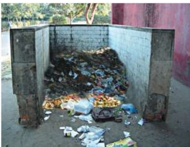
Fig. 16.7 Neighbourhood garbage dump

a few days. In how many days does the bucket become full? You know the number of members in your family. If you find out the population of your city or town, can you now estimate the number of buckets of garbage that may be generated in a day in your city or town? We are generating mountains of garbage everyday, isn't it (Fig. 16.7)?