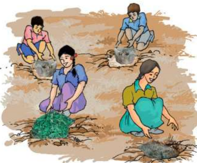
Fig. 16.2 Putting garbage heaps in pits

Now divide the contents of each group into two separate heaps. Label them