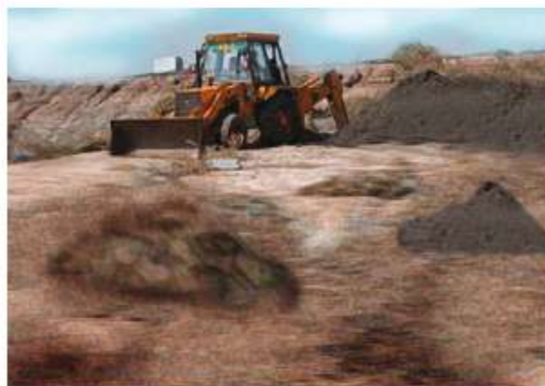
Fig. 16.1 A landfill

There the part of the garbage that can be reused is separated out from the one that cannot be used as such. Thus,