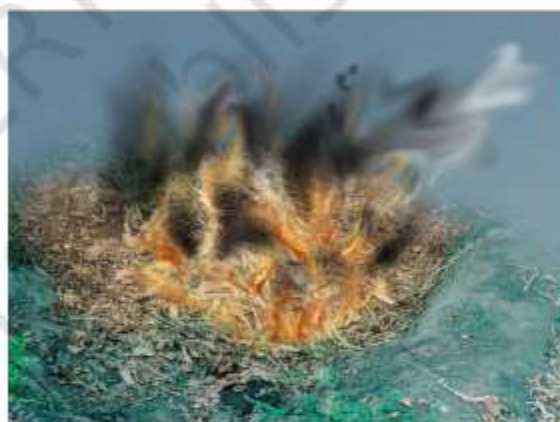
Fig. 16.3 Burning of leaves produce harmful gases

Have you noticed garbage heaps of dried leaves on the roadside? Most of the time these are burnt (Fig. 16.3). Farmers too often burn the husk, dried leaves and part of crop plants in their fields after harvesting. Burning of these, produces smoke and gases that are harmful to our health. We should try to stop such practices. These wastes could be converted into useful compost.