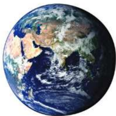
Fig. 14.3 Oceans cover a major part of the earth

Do you know that about two thirds of the Earth is covered with water? Most of this water is in oceans and seas (Fig. 14.3).