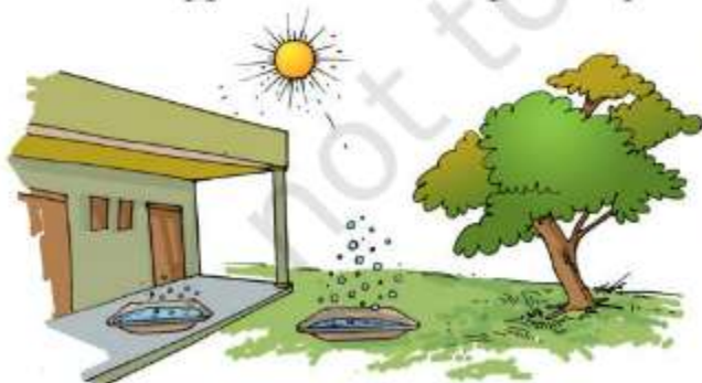
Fig.14.5 Evaporation of water in sunlight and in shade

In Activity 2, did you find that water also disappeared from the plate kept in