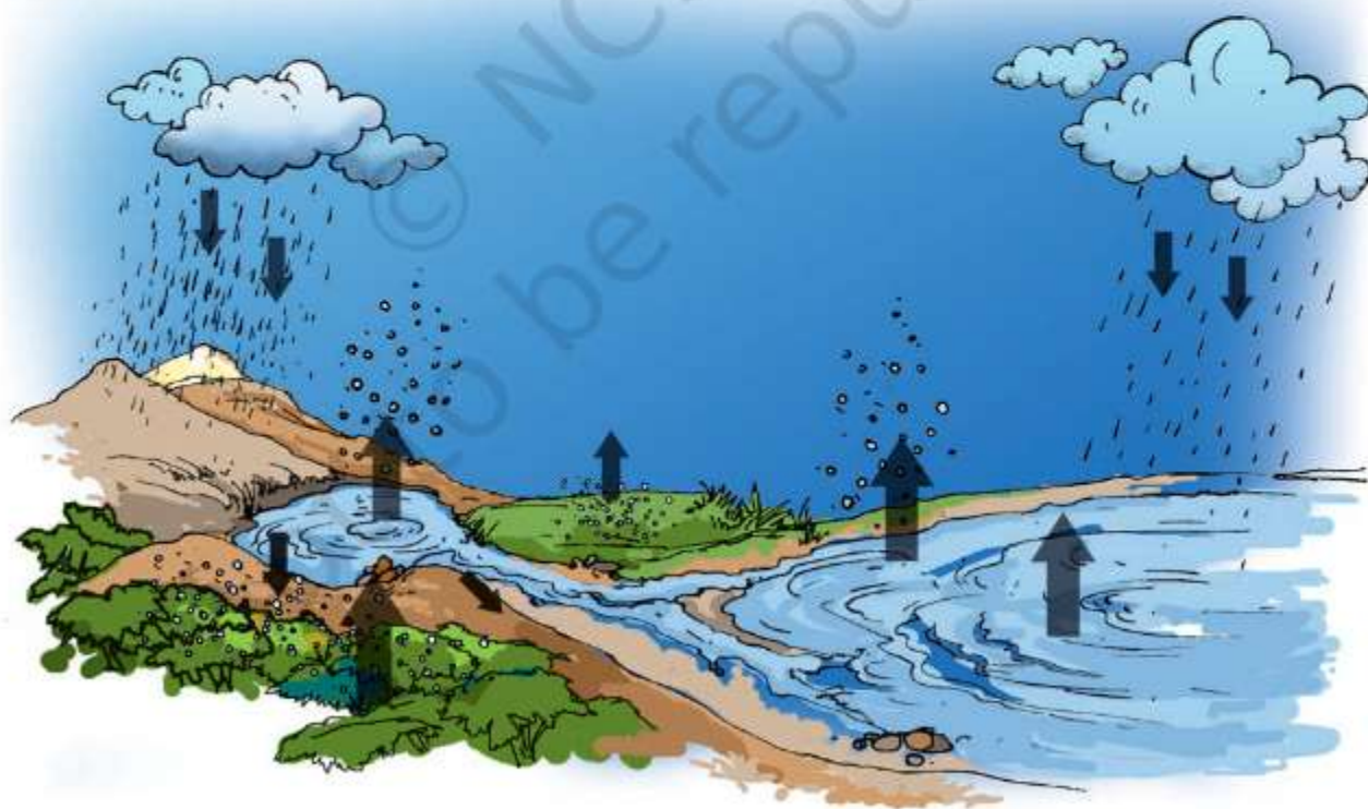
Fig. 14.9 Water cycle

However, excess of rainfall may lead to many problems (Fig. 14.10). Heavy