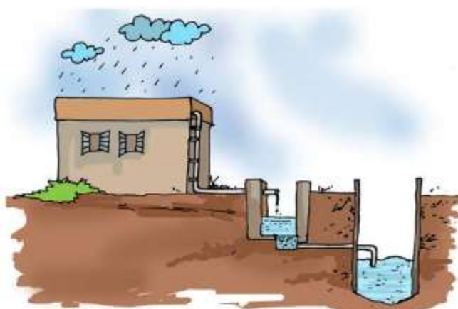
Fig. 14.13 Rooftop rainwater harvesting

1. Rooftop rainwater harvesting : In this system the rainwater is collected from