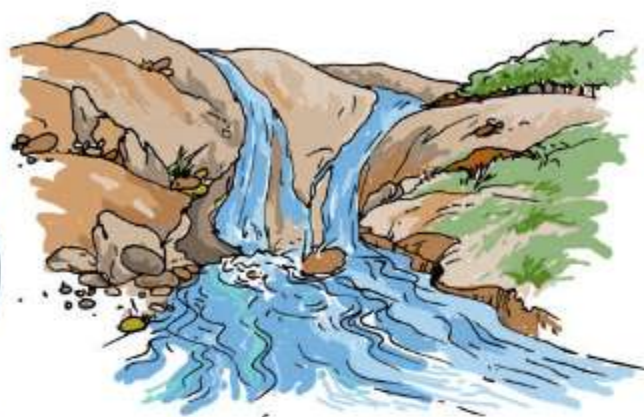
Fig. 14.8 Rainwater flows down in the form of streams and rivers

Snow in the mountains melts into water. This water flows down the mountains in the form of streams and rivers (Fig. 14.8). Some of the water that falls on land as rain, also flows in the form of rivers and streams. Most of the rivers cover long distances on land and ultimately fall into a sea or an ocean. However, water of some rivers flows into lakes.