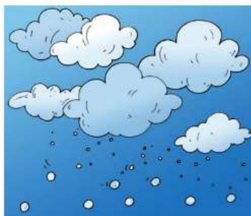
Fig. 14.7 Clouds

It so happens that many droplets of water come together to form larger sized