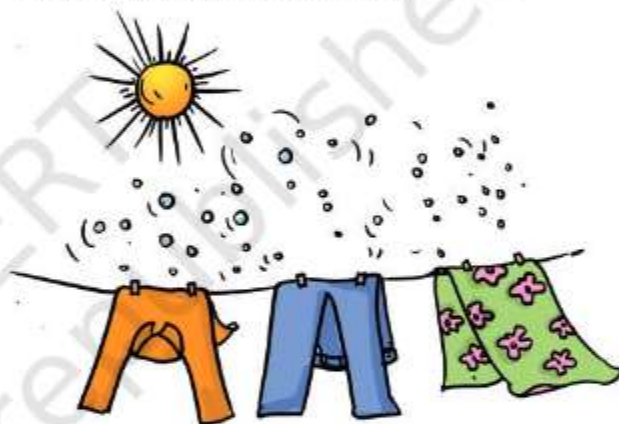
Fig. 14.4 Clothes drying on a clothes-line

How many times have you noticed that water spilled on a floor dries up after some time? The water seems to disappear. Similarly, water disappears from wet clothes as they dry up (Fig. 14.4). Water from wet roads, rooftops and a few other places also disappears after the rains. Where does this water go?