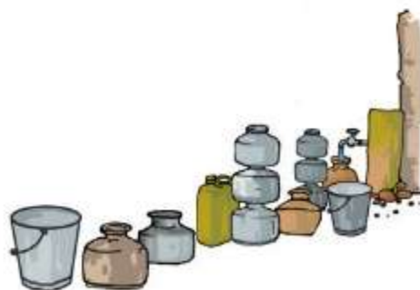
Fig. 14.12 A queue for collecting water

The demand for water is increasing day-by-day. The number of people using water is increasing with rising population. In many cities, long queues for collection of water are a common site (Fig. 14.12). Also, more and more water is being used for producing food and by the industries. These factors are leading