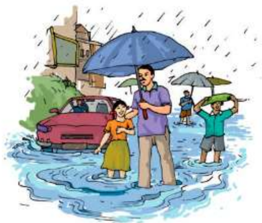
Fig. 14.10 A scene after heavy rains

The time, duration and the amount of rainfall varies from place to place. In some parts of the world it rains throughout the year while there are places where it rains only for a few days.