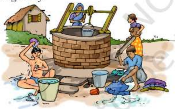
Fig. 14.1 Uses of water

Apart from drinking, there are so many activities for which we use water (Fig. 14.1). Do you have an idea about the quantity of water we use in a single day?