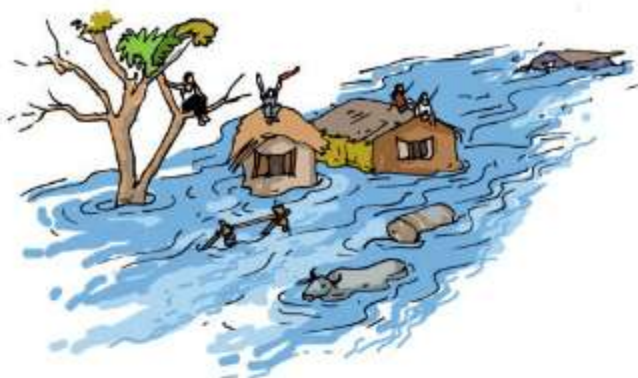
Fig. 14.11 A scene of a flooded area

rains may lead to rise in the level of water in rivers, lakes and ponds. The water may then spread over large areas causing floods. The crop fields, forests, villages, and cities may get submerged by water (Fig. 14.11). In our country, floods cause extensive damage to crops, domestic animals, property and human life.