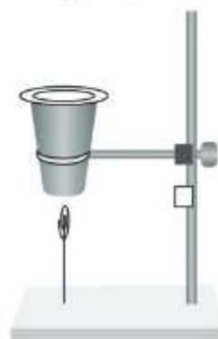
Fig. 13.5 Effect of magnet - a paper clip hanging in air!

Take a plastic or a paper cup. Fix it on a stand with the help of a clamp as shown in Fig. 13.5. Place a magnet inside the cup and cover it with a paper so that the magnet is not visible. Attach a thread to a clip made of iron. Fix the other end of the thread at the base of the stand. (Mind you, the trick involved here, is to keep the length of the thread sufficiently short.) Bring the clip near the base of the cup. The clip is raised in air without support, like a kite.