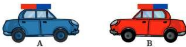
Fig. 13.13 Do opposite poles attract each other?

(Fig. 13.13). In car A, keep the south pole of the magnet towards its front. Place the magnet in opposite direction in car B. Now, place the two cars close to one another (Fig. 13.13). What do you observe? Do the cars remain at their places? Do the cars run away from each other? Do they move towards each other and collide? Record your observations in a table as shown in Table 13.3. Now, place the toy cars close to each other such that the rear side of car A faces the front side of car B (Fig 13.14). Do they move as before? Note the direction in which the cars move now. Next, place the car A behind car B and note the direction in which they move in each case. Repeat the activity by placing cars