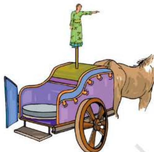
Fig. 13.8 The chariot with direction finding statue

Let us make such a direction finder for ourselves.