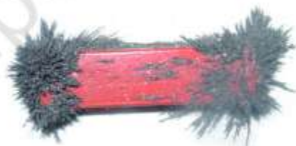
Fig. 13.7 Iron filings sticking to a bar magnet

Spread some iron filings on a sheet of paper. Now, place a bar magnet on this sheet. What do you observe? Do the iron filings stick all over the magnet? Do you observe that more iron filings get attracted to some parts of the magnet than others (Fig. 13.7)? Remove the iron filings sticking to the magnet and repeat the