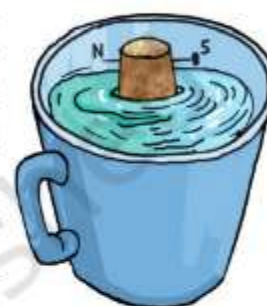
Fig. 13.12 A compass in a cup

Magnetise an iron needle using a bar magnet. Now, insert the magnetised needle through a small piece of cork or foam. Let the cork float in water in a bowl or a tub. Make sure that the needle