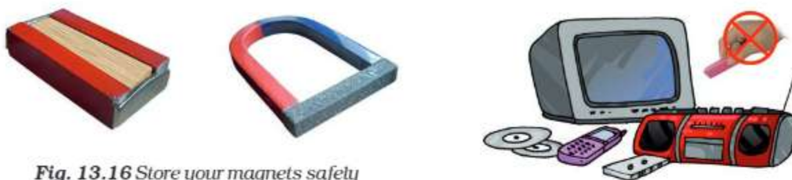
Fig. 13.16 Store your magnets safely

magnets should be kept in pairs with their unlike poles on the same side. They must be separated by a piece of wood while two pieces of soft iron should be placed across their ends (Fig. 13.16).