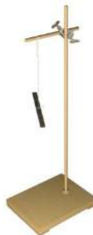
Fig. 13.9 A freely suspended bar magnet always comes to rest in the same direction

Take a bar magnet. Put a mark on one of its ends for identification. Now, tie a thread at the middle of the magnet so that you may suspend it from a wooden stand (Fig. 13.9). Make sure that the magnet can rotate freely. Let it come to rest. Mark two points on the ground to show the position of the ends of the magnet when it comes to rest. Draw a