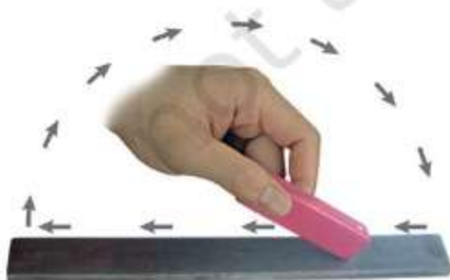
Fig.13.11 Making your own magnet

There are several methods of making magnets. Let us learn the simplest one. Take a rectangular piece of iron. Place it on the table. Now take a bar magnet and place one of its poles near one edge of the bar of iron. Without lifting the bar magnet, move it along the length of the iron bar till you reach the other end. Now, lift the magnet and bring the pole (the same pole you started with) to the same point of the iron bar from which you began (Fig. 13.11). Move the magnet again along the iron bar in the same direction as you did before. Repeat this process about 30-40 times. Bring a pin or some iron filings near the iron bar to check whether it has become a magnet. If not, continue the process for some