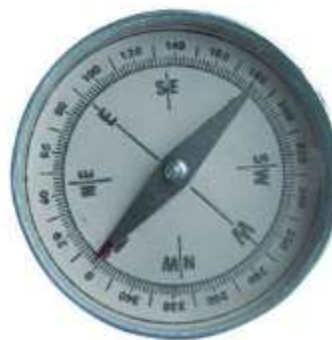
Fig. 13.10 A compass

Later on, a device was developed based on this property of magnets. It is known as the compass. A compass is usually a small box with a glass cover on it. A magnetised needle is pivoted inside the box, which can rotate freely (Fig. 13.10). The compass also has a dial