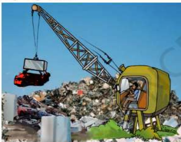
Fig. 13.1 Picking up pieces of iron from waste

P aheli and Boojho went to a place where a lot of waste material was piled into huge heaps. Something exciting was happening! A crane was moving towards the heap of junk. The long hand of the crane lowered a block over a heap. It then began to move. Guess, what? Many pieces of iron junk were sticking to the block, as it moved away (Fig. 13.1)!