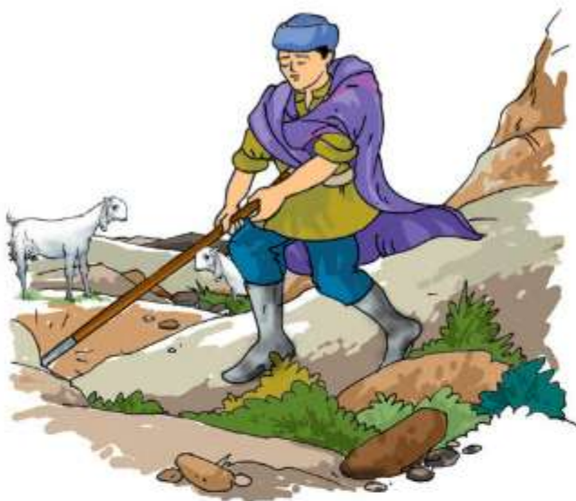
Fig.13.3 A natural magnet on a hillside!

mountainside (Fig. 13.3). It seemed as if the stick was being attracted by the rock. The rock was a natural magnet and it attracted the iron tip of the shepherd's stick. It is said that this is how natural magnets were discovered. Such rocks were given the name magnetite, perhaps after the name of that shepherd. Magnetite contains iron. Some people believe that magnetite was first discovered at a place called Magnesia. The substances having the property of attracting iron are now known as magnets. This is how the story goes.