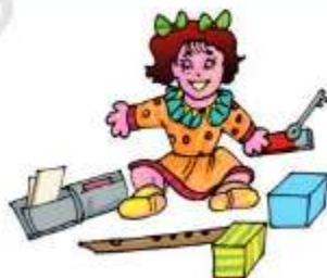
Fig. 13.17 An intelligent doll