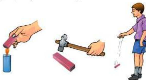
Fig. 13.15 Magnets lose their property on heating, hammering and dropping

Magnets lose their properties if they are heated, hammered or dropped from some height (Fig. 13.15). Also, magnets become weak if they are not stored properly. To keep them safe, bar