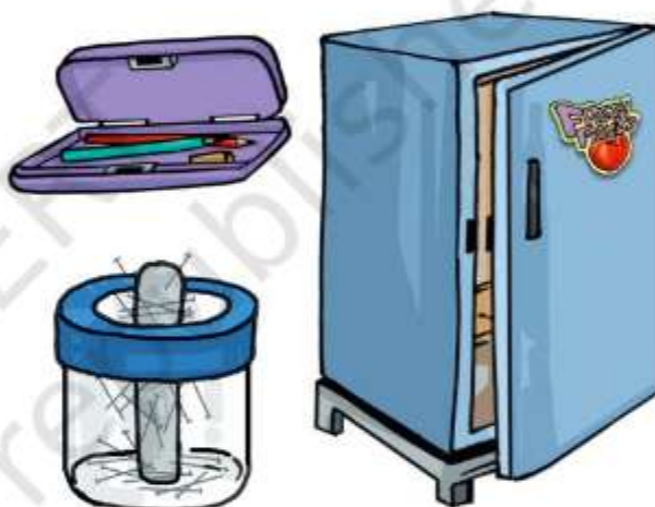
Fig. 13.2 Some common items that have magnets inside them

sticking to the holder. In some pencil boxes, the lid fits tightly when we close it even without a locking arrangement. Such stickers, pin holders and pencil boxes have magnets fitted inside (Fig. 13.2). If you have any one of these items, try to locate the magnets hidden in these.