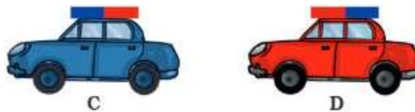
Fig. 13.14 Repulsion between similar poles?

(Fig. 13.13). In car A, keep the south pole of the magnet towards its front. Place the magnet in opposite direction in car B. Now, place the two cars close to one another (Fig. 13.13). What do you observe? Do the cars remain at their places? Do the cars run away from each other? Do they move towards each other and collide? Record your observations in a table as shown in Table 13.3. Now, place the toy cars close to each other such that the rear side of car A faces the front side of car B (Fig 13.14). Do they move as before? Note the direction in which the cars move now. Next, place the car A behind car B and note the direction in which they move in each case. Repeat the activity by placing cars