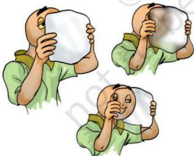
Fig. 4.7 Looking through opaque, transparent or translucent material

You might have played the game of hide and seek. Think of some places where you would like to hide so that you are not seen by others. Why did you choose those places? Would you have tried to