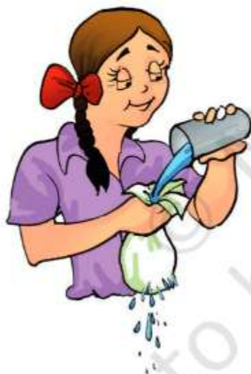
Fig. 4.2 Using a cloth tumbler

Have you ever wondered why a tumbler is not made with a piece of cloth? Recall our experiments with pieces of cloth in Chapter 3 and also keep in mind that we generally use a tumbler to keep a liquid. Therefore, would it not be silly, if we were to make a tumbler out of cloth (Fig 4.2)! What we need for a tumbler is glass, plastics, metal or other such material that will hold water. Similarly, it would not be wise to use paper-like materials for cooking vessels.