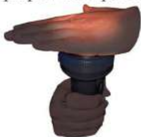
Fig. 4.9 Does torch light pass through your palm?

We can therefore group materials as opaque, transparent and translucent.