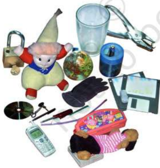
Fig. 4.1 Objects around us

Let us collect as many objects as possible, from around us. Each of us could get some everyday objects from home and we could also collect some objects from the classroom or from outside the school. What will we have in our collection? Chalk, pencil, notebook, rubber, duster, a hammer, nail, soap, spoke of a wheel, bat,