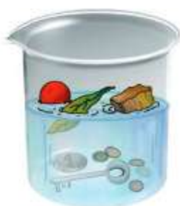
Figure 4.6 Some objects float in water while others sink in it

drops of honey that you let fall into a glass of water. What happens to all of these?