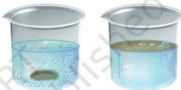
Fig. 4.4 What disappears, what doesn't?

beakers. Fill each one of them about two-thirds with water. Add a small amount (spoonful) of sugar to the first glass, salt to the second and similarly, add small amounts of the other substances into the other glasses. Stir the contents of each of them with a spoon. Wait for a few minutes. Observe what happens to the substances added to water (Fig. 4.4). Note your observations as shown in Table 4.3.