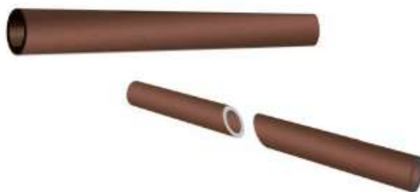
Fig. 4.3 Cutting pieces of materials to see if they have lustre

Do you notice such a shine or lustre in the other materials, cut them anyway as you can? Repeat this in the class with as many materials as possible and make a list of those with and without lustre. Instead of cutting, you can rub the surface of material with sand paper to see if it has lustre.