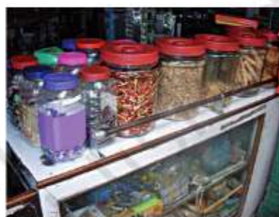
Fig. 4.8 Transparent bottles in a shop

hide behind a glass window? Obviously not, as your friends can see through that and spot you. Can you see through all the materials? Those substances or materials, through which things can be seen, are called transparent (Fig. 4.7). Glass, water, air and some plastics are examples of transparent materials. Shopkeepers usually prefer to keep biscuits, sweets and other eatables in transparent containers of glass or