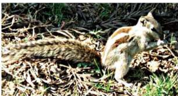
Fig. 1.8 Squirrel eating nuts

You will then surely be aware of the food, the animal eats. What about other animals? Have you ever observed what a squirrel (Fig 1.8), pigeon, lizard or a small insect may be eating as their food?