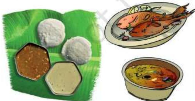
Fig. 1.1 Different food items

There seems to be so much variety in the food that we eat (Fig 1.1). What are these food items made of?