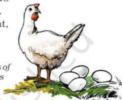
(b) Animal sources