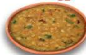
(a) Plant sources