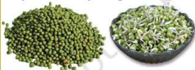
Fig. 1.5 Whole moong and its sprouts

Take some dry seeds of moong or chana . Put a small quantity of seeds in a container filled with water and leave this aside for a day. Next day, drain the water completely and leave the seeds in the vessel. Wrap them with a piece of wet cloth and set aside. The following day, do you observe any changes in the seeds?