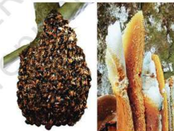
Fig. 1.7 Beehive

Do you know where honey comes from, or how it is produced? Have you seen a beehive where so many bees keep buzzing about? Bees collect nectar (sweet juices) from flowers, convert it