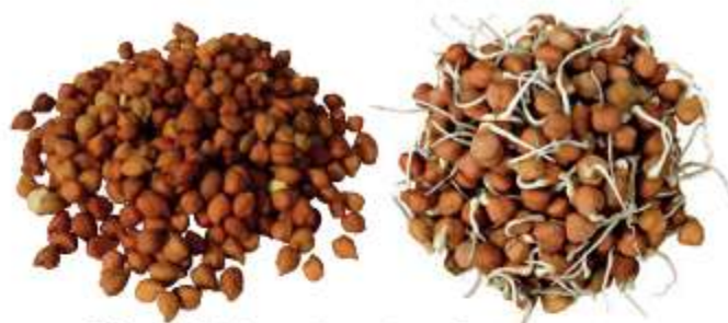
Fig. 1.6 Chana (gram) and its sprouts

A small white structure may have grown out of the seeds. If so, the seeds have sprouted (Fig. 1.5 and 1.6). If not, wash the seeds in water, drain the water and leave them aside for another day,