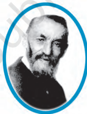
G. Peano (1858-1932)

In contrast to deduction, inductive reasoning depends on working with each case, and developing a conjecture by observing incidences till we have observed each and every case. It is frequently used in mathematics and is a key aspect of scientific reasoning, where collecting and analysing data is the norm. Thus, in simple language, we can say the word induction means the generalisation from particular cases or facts.