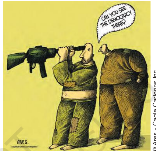
Seeing the democracy