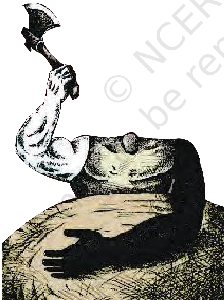
© Ares - Cagle Cartoons Inc.

It is fairly common for people belonging to the same religion to feel that they do not belong to the same community, because their caste or sect is very different. It is also possible for people from different religions to have the same caste and feel close to each other. Rich and poor persons from the same family often do not keep close relations with each other for they feel they are very different. Thus, we all have more than one identity and can belong to more than one social group. We have different identities in different contexts.