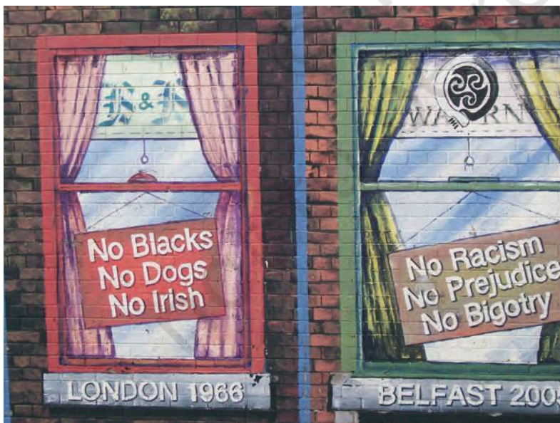
In some societies of Northern Ireland, the colonies of Protestant and Catholic communities are divided by walls. These walls are sometimes filled with graffiti as you can see here. The Irish Republican Army and British Government signed an agreement in 2005. What does the graffiti here tell about the conflict in the society?

Second, it depends on how political leaders raise the demands of any community. It is easier to accommodate demands that are within the constitutional framework and are not at the cost of another community.