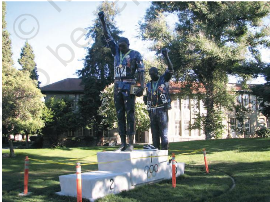
In 2005, the San Jose State University installed a 20-foot high sculpture representing the protest by Tommie Smith and John Carlos. A photograph of the original medal ceremony in 1968 is on the top.

Do you think that Carlos and Smith should have raised an internal matter of American society in an international forum? Would you say that what they did was political? Why do you think Peter Norman, who was neither Black nor American, joined in the gesture of protest? If you were in Norman's place what would you do?