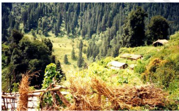
Figure 16.2 A view of a forest life

their teak from a forest farther away. They do not have any stake in ensuring that one particular area should yield an optimal amount of some produce for all generations to come. What do you think will stop the local people in behaving in a similar manner?