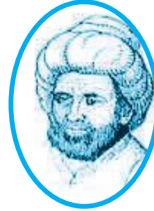
Muhammad ibn Musa al-Khwarizmi (C.E. 780 – 850)

A lemma is a proven statement used for proving another statement.